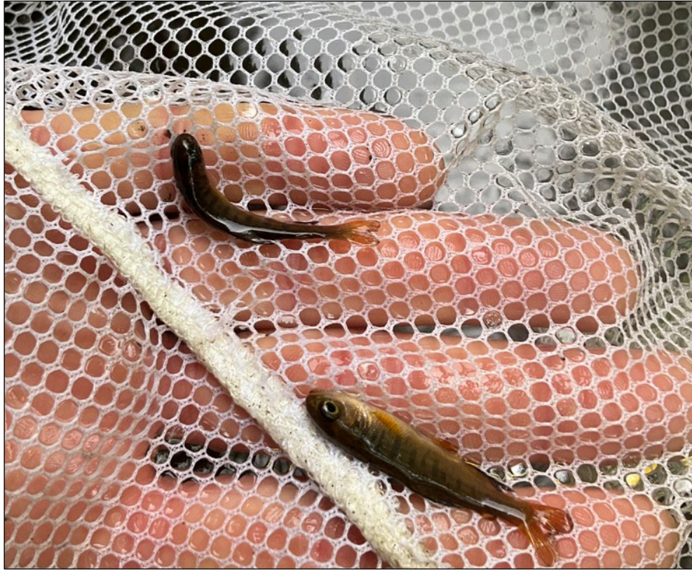
Figure 1.—Juvenile coho salmon captured at waypoint 122.