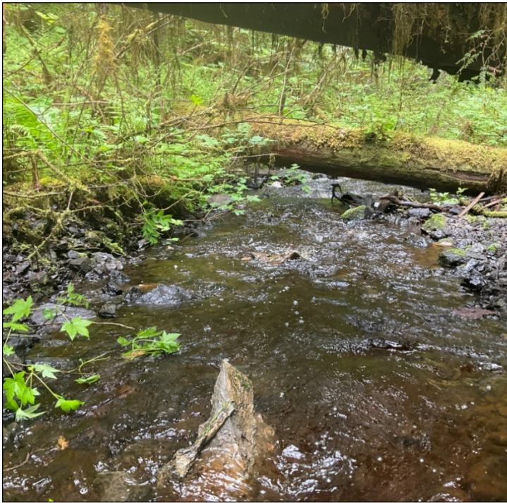
Figure 2.—Channel at waypoint 127.