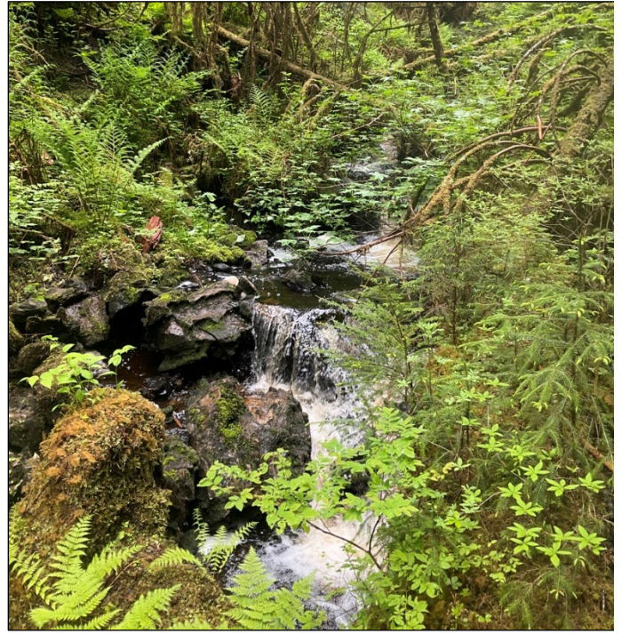
Figure 3.—Channel at waypoint 128.